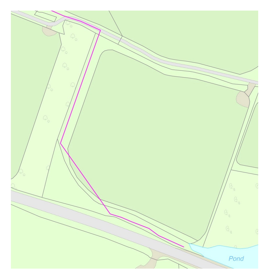
The Correct ESCC Rights of Way Map for the site.

38. Figure 3 of the Officer's Report shows what is claimed to be the right of way crossing the site. This is not the correct map, the correct ESCC rights of way map is shown below: